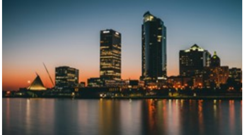
Milwaukee skyline