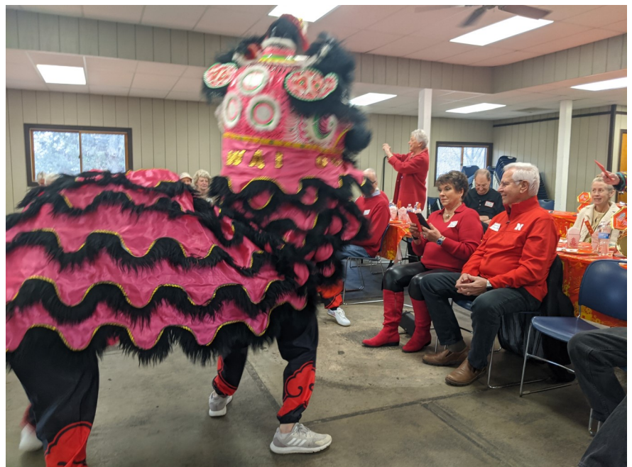
Lion dancers entertain FFL