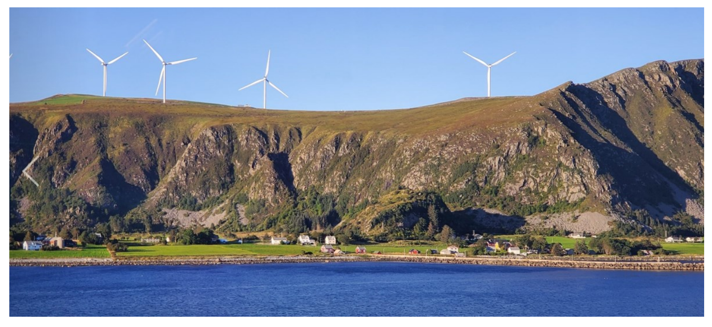
Photo of one of the fjords in Norway taken during the 'Festival at Sea' FFI cruise.

large unsolicited donation from a member. The current FFI board and staff decided to work on soliciting funds for a rebuilding of the club. Japan FF members donated $10/ member for continuing the support of FFI. Currently eight people are part of the FFI staff, with no brick and mortar office and all staff and board meetings are organized via Zoom. The FFI staff works from home. This "Festival at Sea" brought the first influx of dollars since Covid began.