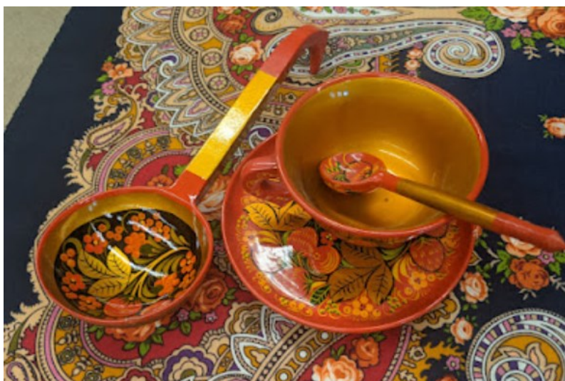
Photo caption: Traditional Russian painted wooden spoons and dishes displayed by Barb Ritter.