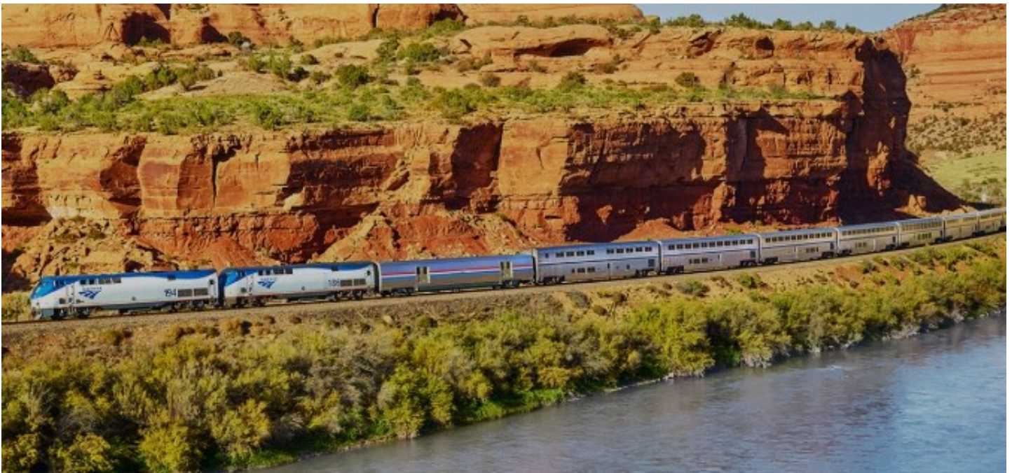
Photo caption: AMTRAK's California Zephyr train travels from Chicago, through Denver, Glenwood Springs to Emeryville (San Francisco)

My interests over the years have included being a 4-H leader in Madison County, a member of the Norfolk Frontiersman Muzzleloader Rifle Club, camping, golfing and gardening. I mostly enjoy any activity which is outdoors, in nature off the beaten path, at the ocean, or in the mountains.