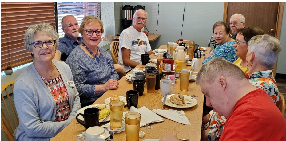
Photo description: FFL members during Breakfast and Conversation at Stauffer’s Café on July 9th, 2022.

delightful. Many members learned about other cultures on Day Trips to the American Museum of Germans from Russia and the Swedish Cultural Center. Virtual journeys were enjoyed by many via Heygo. FF International has also offered new ways to learn more about our world without leaving home – book club, virtual journeys. Personally, I pretty much stayed home for two years, so this year I am taking three big trips – (1) a tour to the Passion Play in Oberammergau Germany and on to Austria and the Czech Republic in June, (2) a family trip to Williamsburg, VA and Washington DC, in July and (3) the FFI Festival at Sea in Aug/Sept.