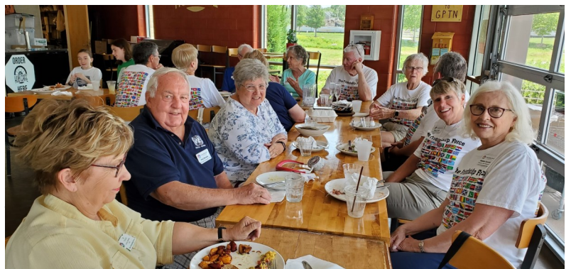
Photo description: Lunch with Greater Omaha Friendship Force members and their New Hampshire Seacoast Friendship Force guests. On June 18, 2022.