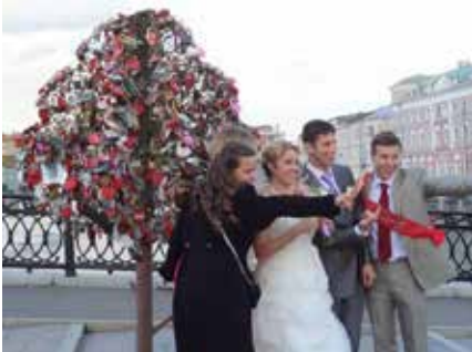
Moscow wedding traditions include tossing locks and keys into metal trees in parks.

FFL looks forward to resuming their opportunities to visit overseas clubs at least once a year, and to host an international club in Lincoln. There will also be visits by clubs in the United States and by Lincoln members to other domestic sites. Lincoln received its journey assignments for 2022. They are Inbound: Southern New Jersey to Lincoln and a Farm to Table - Globally recruited inbound Journey together with Quad Cities. Outbound: Lincoln to Moscow and St. Petersburg, Russia and Lincoln to Central North Carolina. Dates have not been finalized.