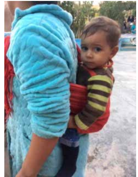
A Berber boy captured the hearts of American Friendship Force members during their visit to a Berber village in Morocco.

They also visited the city of Viborg, Russia for several nights. The city was interested in forming a Friendship Force Club and asked for the help of the Madison Club to provide guidance in their process. They also provided cultural events and socials, presenting their Russian heritage to the group.