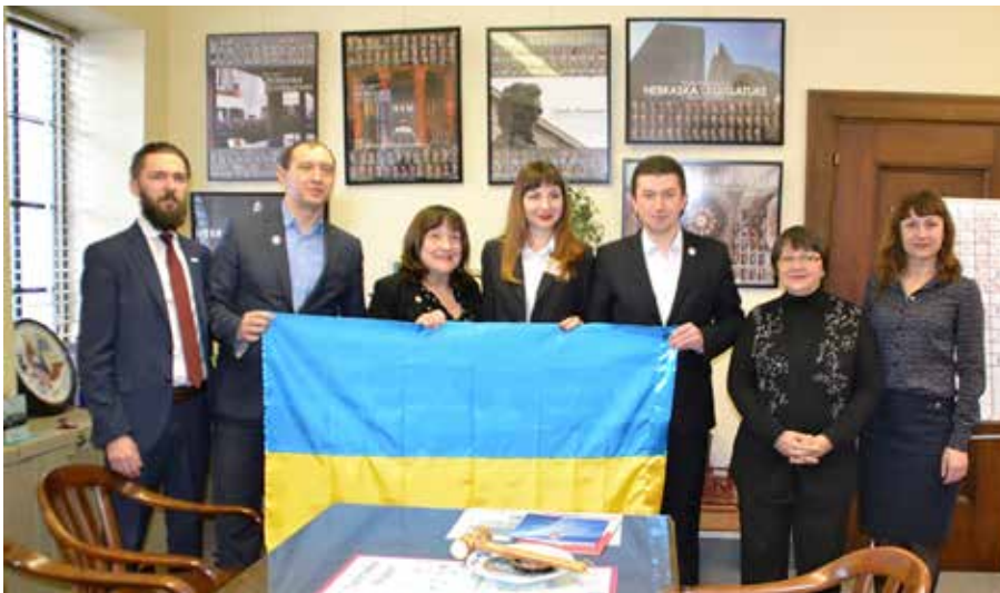
Open World delegates presenting the Ukrainian Flag to Senator Lydia Brasch.