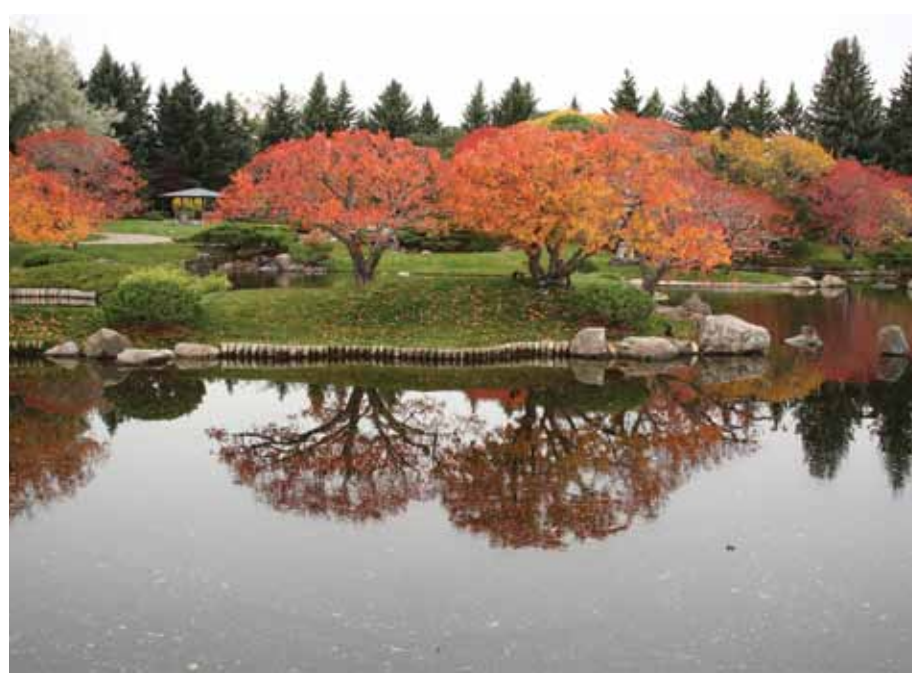
The beautiful Nikka Yuko Gardens in Lethbridge, Alberta await you.

earn more about an exciting exchange opportunity July 18 - 25, 2011 with our neighbors to the north, Lethbridge, Alberta. The informational session will include discussion of travel options, a possible stop-over exchange in Montana, and an add-on trip to the beautiful Canadian Rockies. Lethbridge's most magnificent characteristic is its coulees - a network of large rolling hills that were formed by glacial spill water over ten thousand years ago. Crossing the coulees and the city's water soure, the Oldman River, is the world's largest High Level Bridge, an impressive structure at 314 feet. The area's