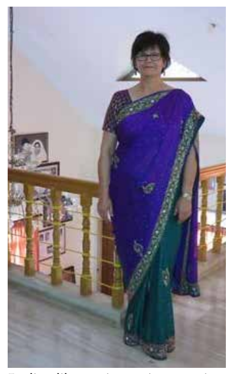
Feeling like a princess in my sari

oin the exchange to the Northwest! The Seattle and Columbia Cascades Clubs are busy planning activities. Ocean and mountains, museums and an old fort await us. We fly to Seattle September 14; we go to Portland by train September 20; we return home September 26. Add your name to those already expecting to go on the adventure. Contact Barb Ridder (402) 435-0270 or bridder@neb.rr.com.